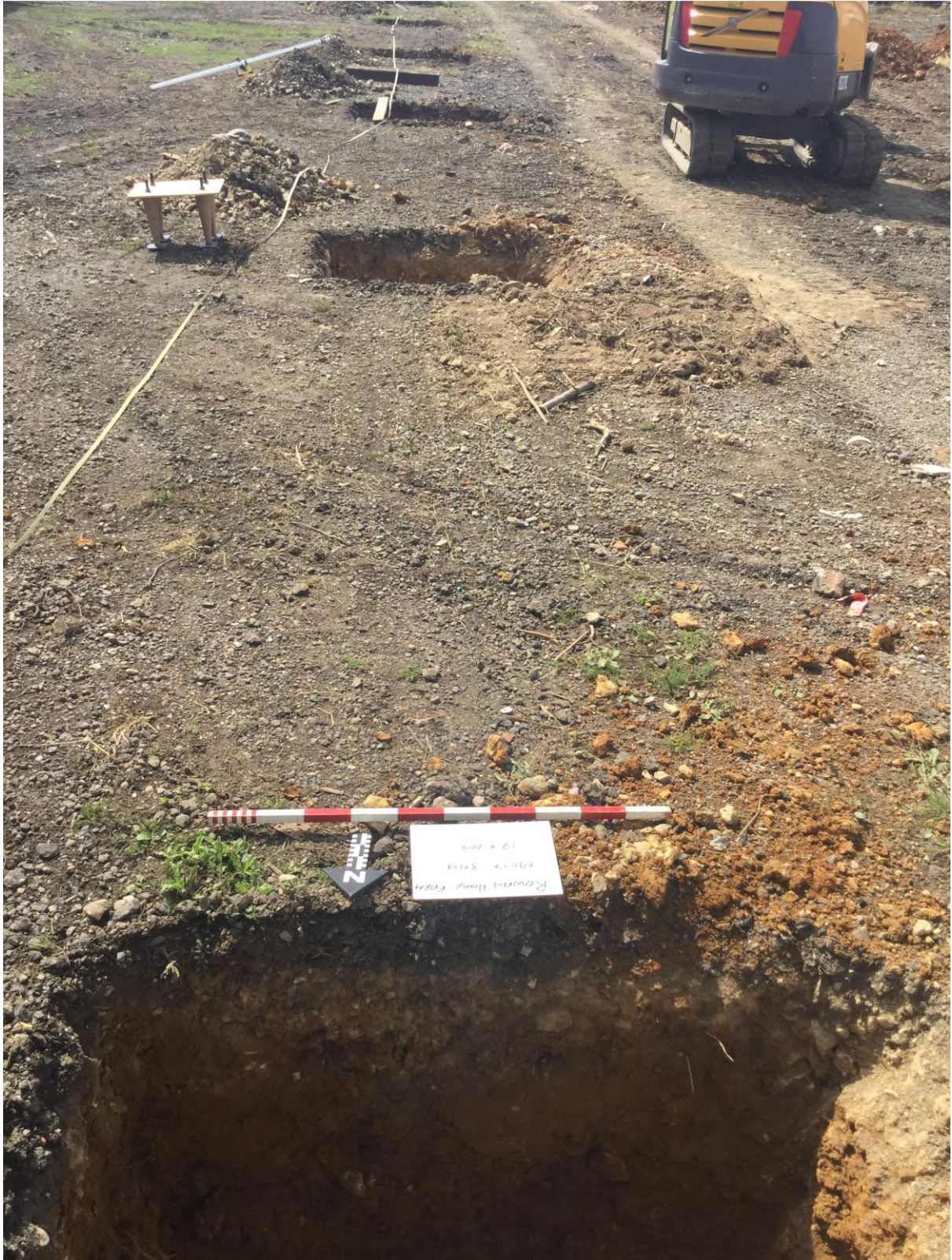
Plate 2. View of the site (looking S)