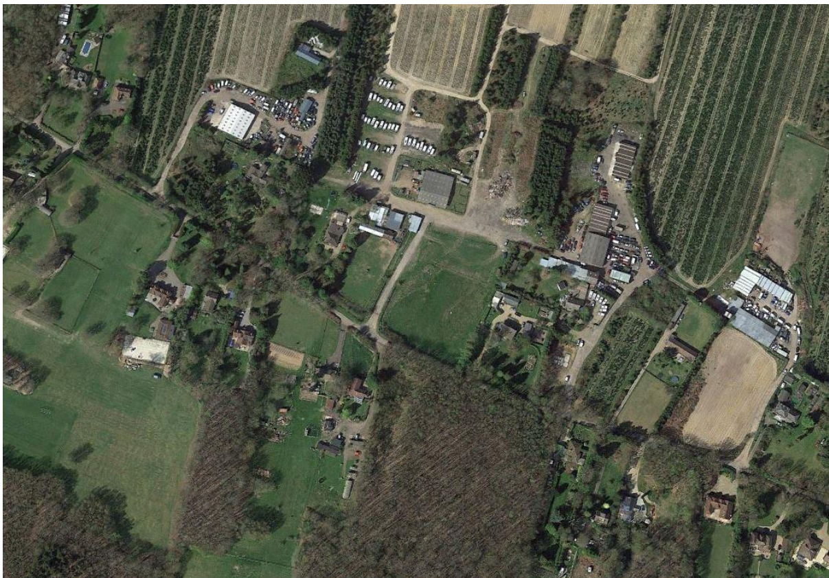
AP 1. View of proposed development area (2017)