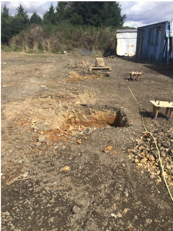
Plate 4. View of foundation pits