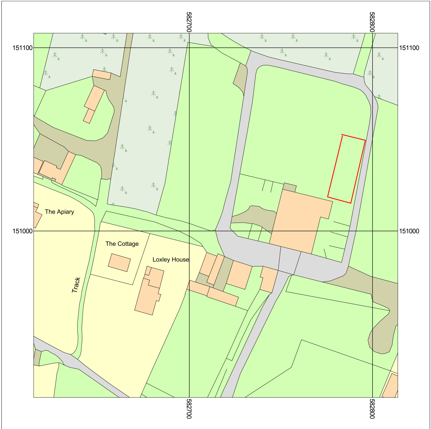
Figure 1 Location of area watched