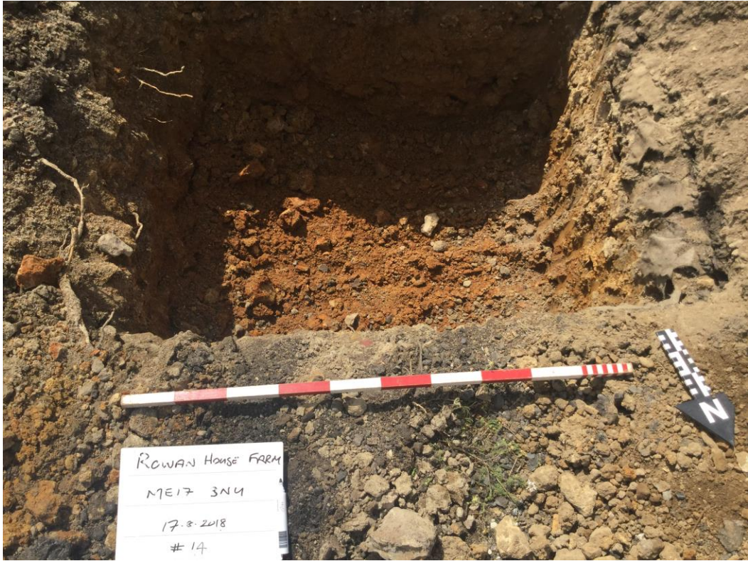
Plate 5. Foundation trench (looking S)