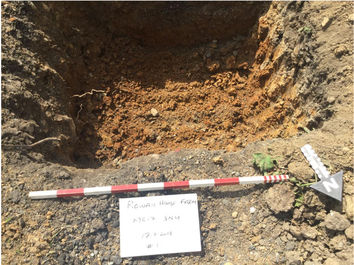
Plate 3. View of foundation trench (looking S)