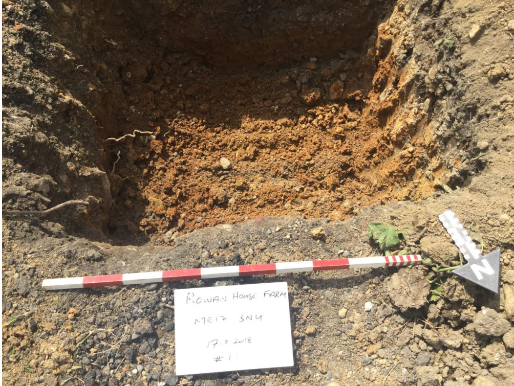
Plate 6. Foundation trench (looking S)